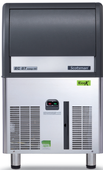
Small gourmet cube 8g, 21mm dia x H 25mm

ECS 87 AS OX Small gourmet cube 8g, Ø21mm x 25mm