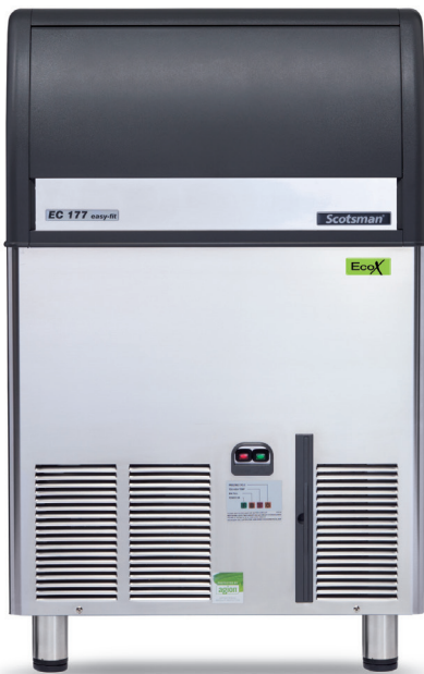
Medium gourmet cube 20g, 30mm dia x H 34mm

ECM 177 AS OX Medium gourmet cube 20g, Ø30mm x 34mm