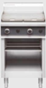
CT6 600mm Gas Griddle Toaster