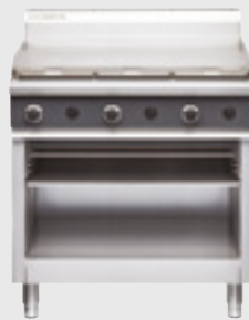
CT9 900mm Gas Griddle Toaster

W 600mm D 800mm H 915mm INCL. SPLASHBACK 1085mm