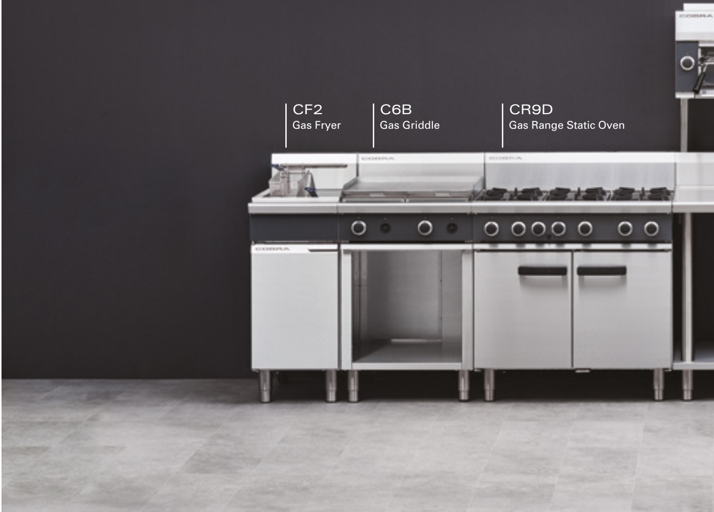
A SUGGESTED CAFÉ LINEUP