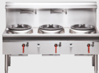
CW3H 1800mm Three Hole Gas Waterless Woks

W 1200mm D 800mm H 771mm INCL. SPLASHBACK 1280mm