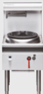
CW1H 600mm One Hole Gas Waterless Wok

CW1H-C 1 Hole, 1 Chimney Burner CW1H-D 1 Hole, 1 Duckbill Burner