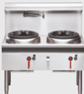
CW2H 1200mm Two Hole Gas Waterless Wok

W 600mm D 800mm H 771mm INCL. SPLASHBACK 1280mm