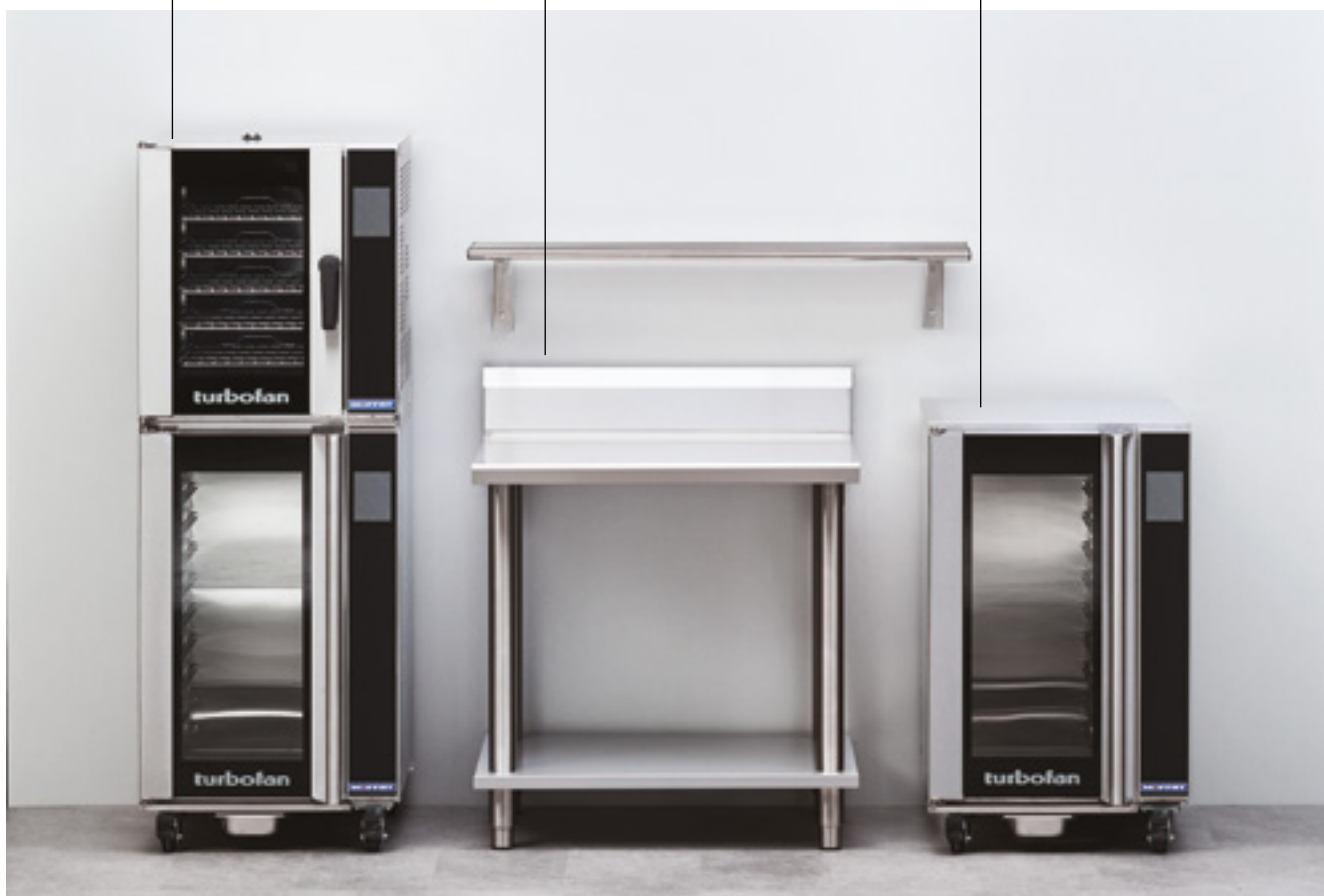
H10T Turbofan Holding Cabinet