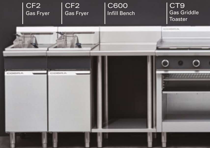
A SUGGESTED EVENT CENTRE LINEUP