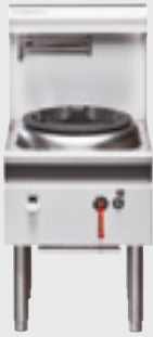
CW1H 600mm One Hole Gas Waterless Wok

CW1H-C 1 Hole, 1 Chimney Burner CW1H-D 1 Hole, 1 Duckbill Burner