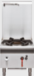
CSP6 600mm Gas Waterless Stockpot