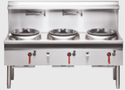
CW3H 1800mm Three Hole Gas Waterless Woks

W 1200mm D 800mm H 771mm INCL. SPLASHBACK 1280mm