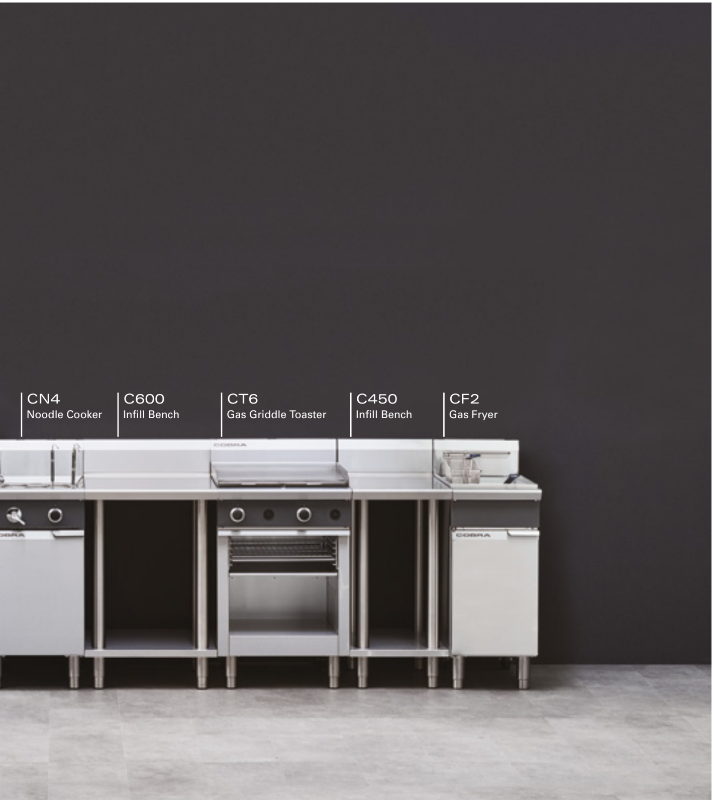
CN4 Noodle Cooker