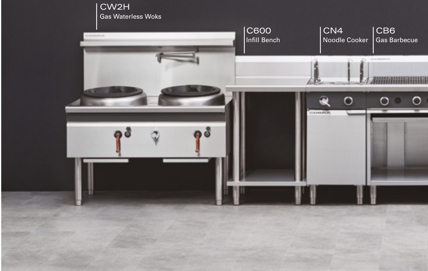
A SUGGESTED FUSION RESTAURANT LINEUP