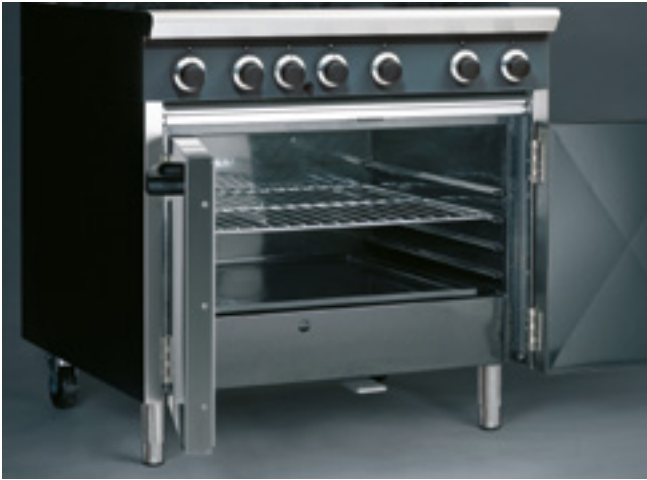
THE 900MM WIDE COBRA OVEN RANGE FEATURES A FULL WIDTH OVEN WITH GENEROUS CROWN HEIGHT AND SPACE SAVING FRENCH DOORS.