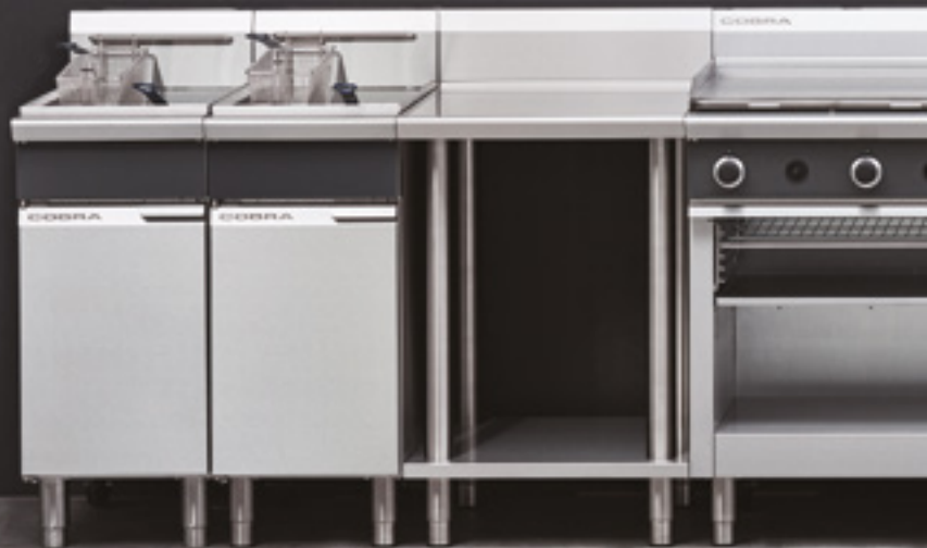
A SUGGESTED EVENT CENTRE LINEUP