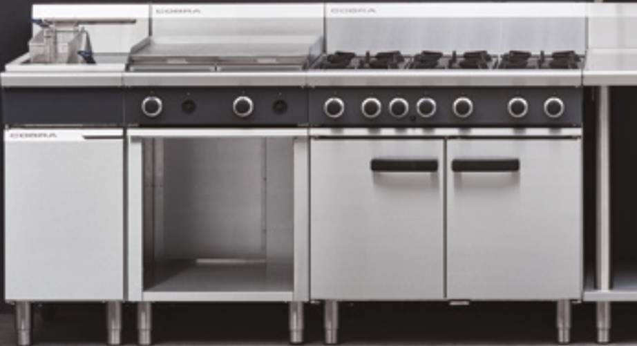
A SUGGESTED CAFÉ LINEUP