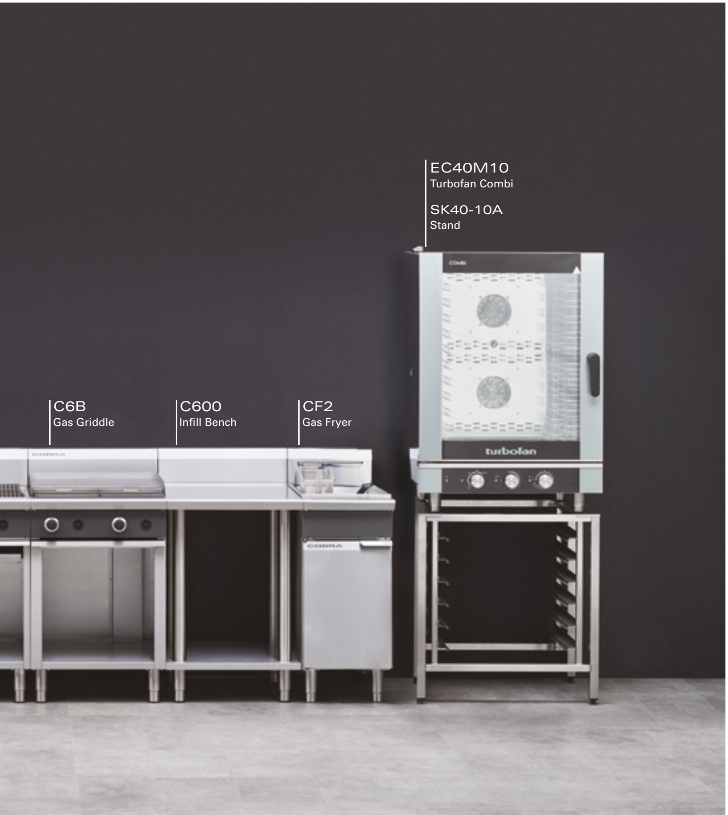
C6B Gas Griddle