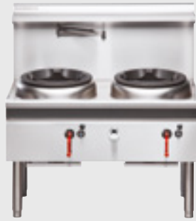
CW2H 1200mm Two Hole Gas Waterless Wok

W 600mm D 800mm H 771mm INCL. SPLASHBACK 1280mm