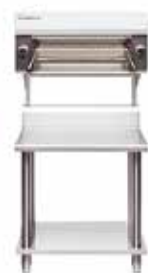
CS9 / C900-S