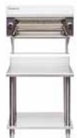
CS9 / C900-S