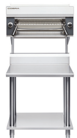
CS9 / C900-S