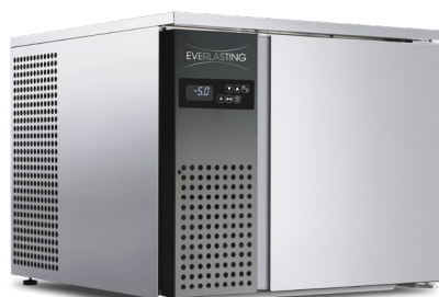
Mod. BASIC TRAY 04