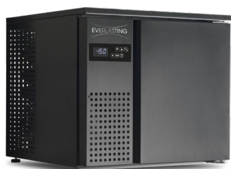
Mod. BASIC TRAY MINI