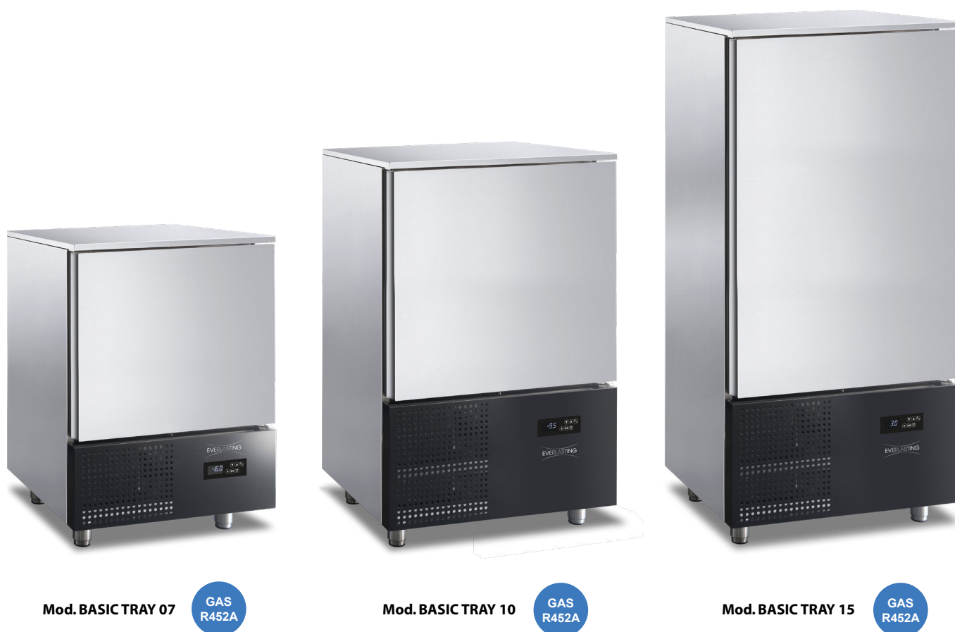
Mod. BASIC TRAY 07

Package on pallet with cardboard included