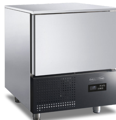
Mod. BASIC TRAY 05