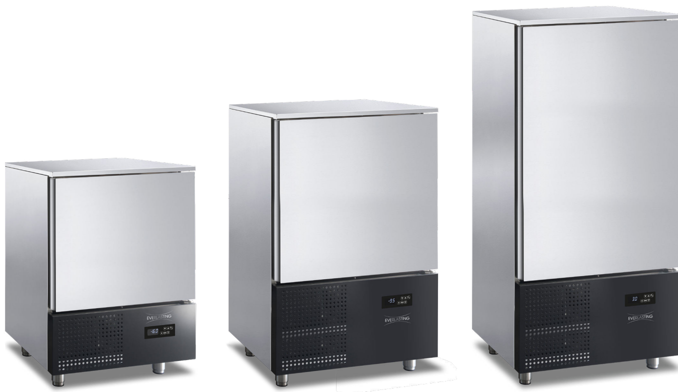
Mod. BASIC TRAY 07

Package on pallet with cardboard included