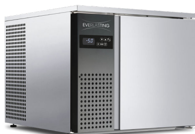
Mod. BASIC TRAY 04