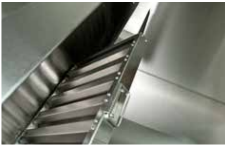
Stainless steel baffles