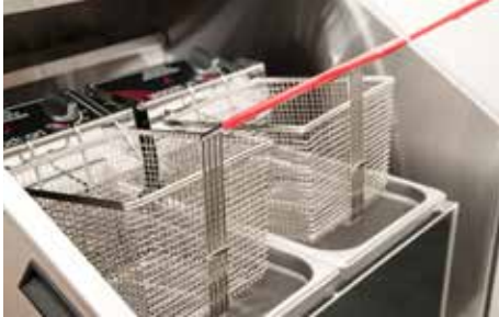
Easily accomodates Woodson countertop fryers

Perfect for situations where a ducted system is impractical or uneconomical, the Woodson Mobile Ventilation Station is your mobile kitchen solution.